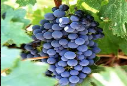
AGRICULTURAL WASTE PRODUCTS